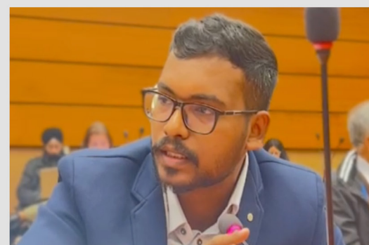
IDSN delegation at UN Forums in 2024.