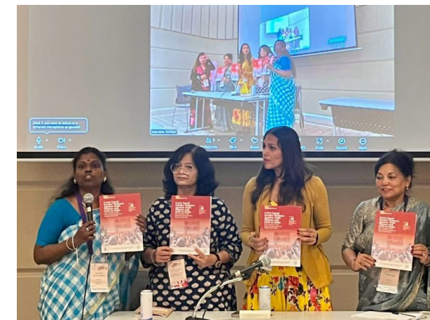
AWID Forum in Bangkok.