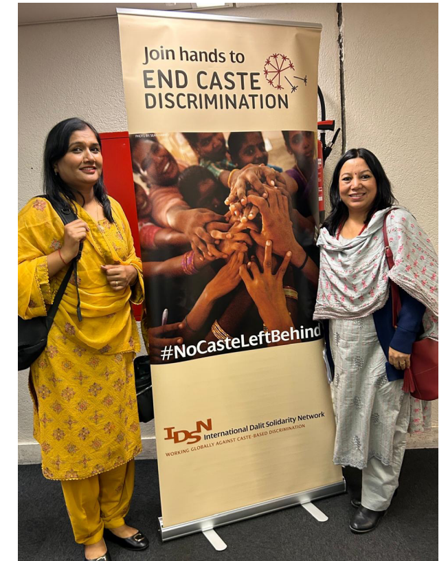
Dalit HRDs from Pakistan and Nepal at the UN HRC