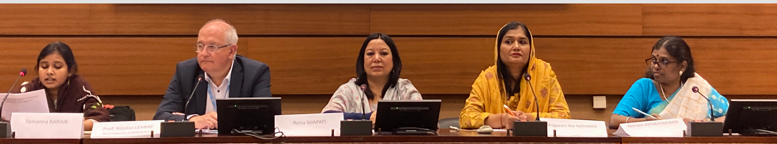
Panel at the UN event.

Dalit women human rights defenders highlighted the need to explicitly address caste discrimination, as a root cause of widespread human rights violations, at a UN Human Rights Council IDSN side-event on 18 September 2024. The event also featured a keynote speech by the UN Special Rapporteur on Minority Issues.