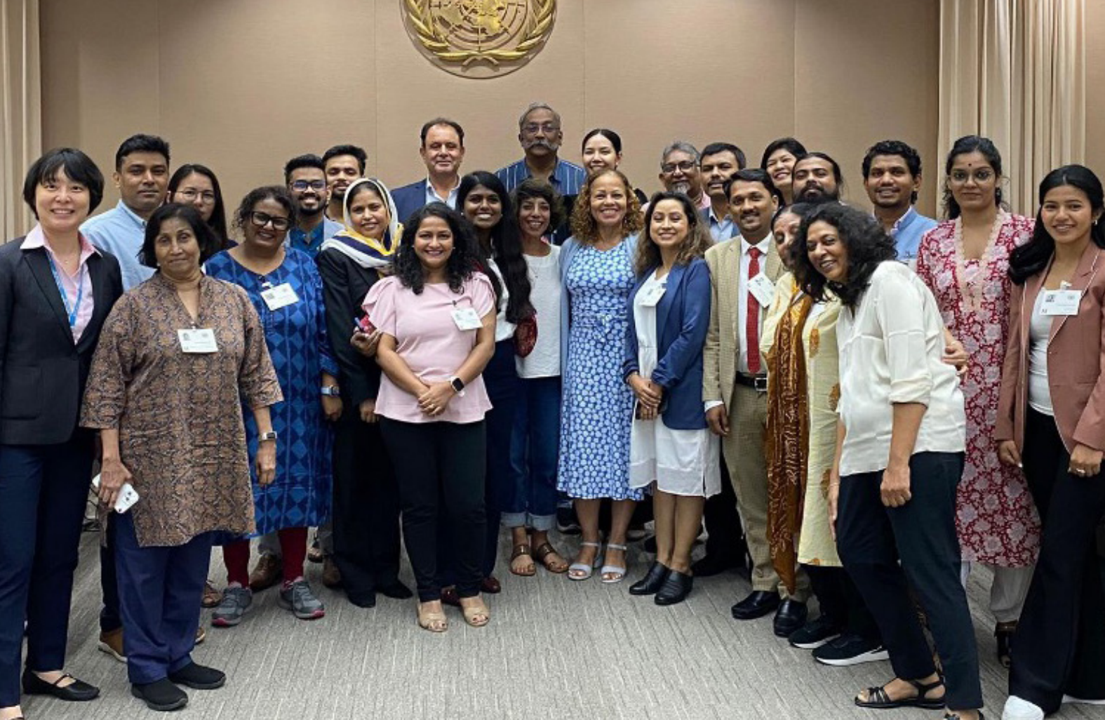
Participants at workshop.