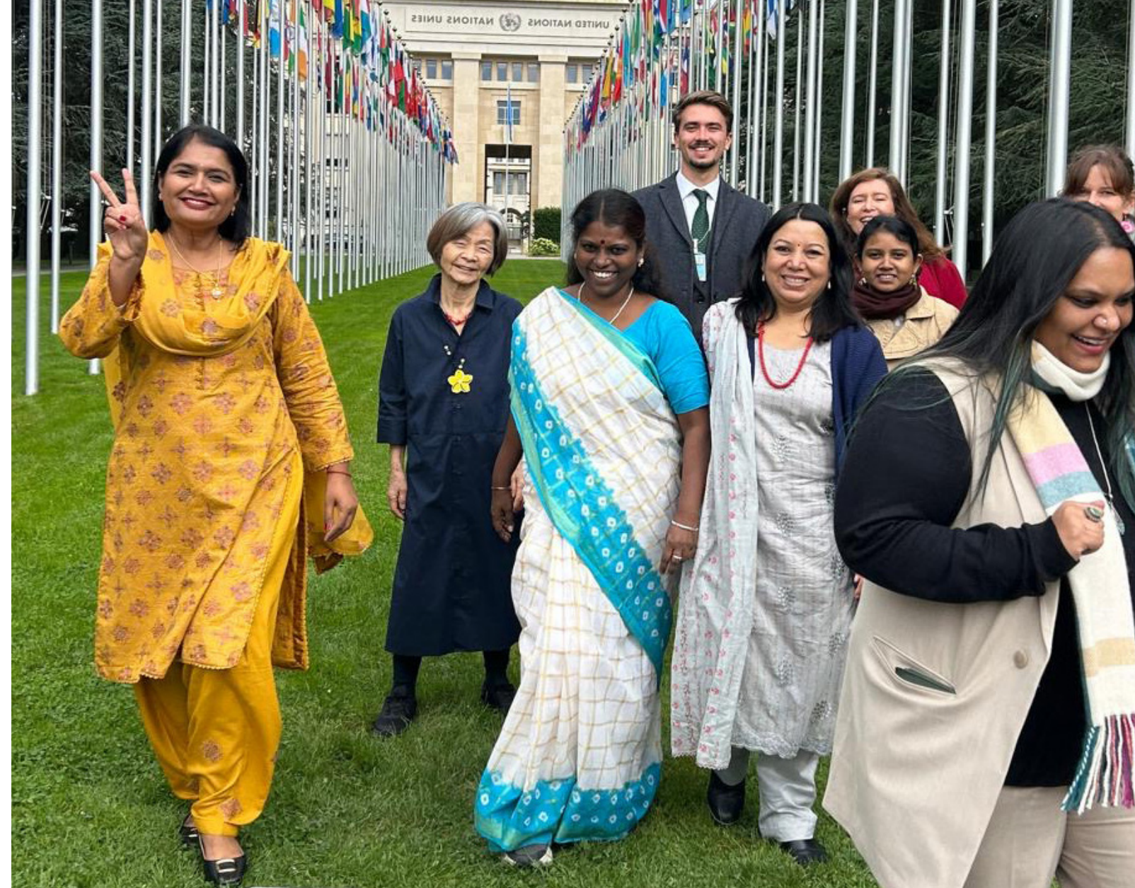
IDSN delgation of Dalit women human rights defenders at the UN Human Rights Council - September 2024

Noting the low representation of Dalit women in decision-making and the limited impact of broader interventions, the report urged the Expert Mechanism to explicitly address the distinct challenges of Dalit women in its study and recommendations to ensure their targeted inclusion and genuine agency for equitable development.