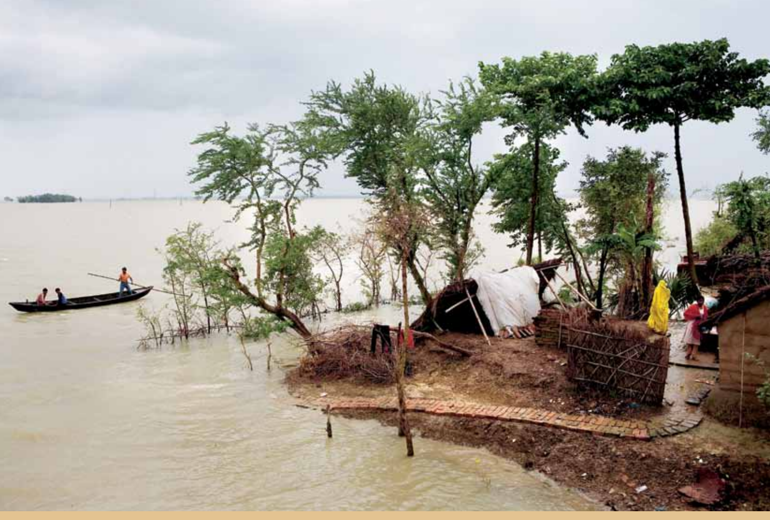
Dalits are more vulnerable than other groups to both natural and human-made disasters for a number of reasons. These include the location of their homes, usually in marginal lands in the periphery of settlements, and the nature of their housing – Dalits often have little or no land rights. This area in Bihar, India, was severely affected by the 2007 floods.

This report is an outcome of an EU-funded initiative by the International Dalit Solidarity Network (IDSN).