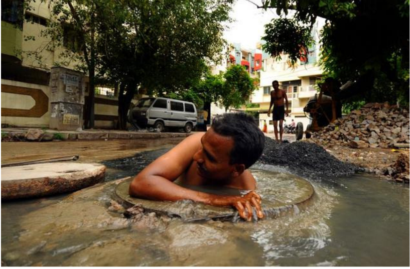
In this July 7, 2010 photo, a sewerage worker clears a choked drain at Anandnagar, Hyderabad.

The obnoxious practice will continue in one form or the other, as long as the government and society treat certain so-called menial jobs as the preserve of one community.