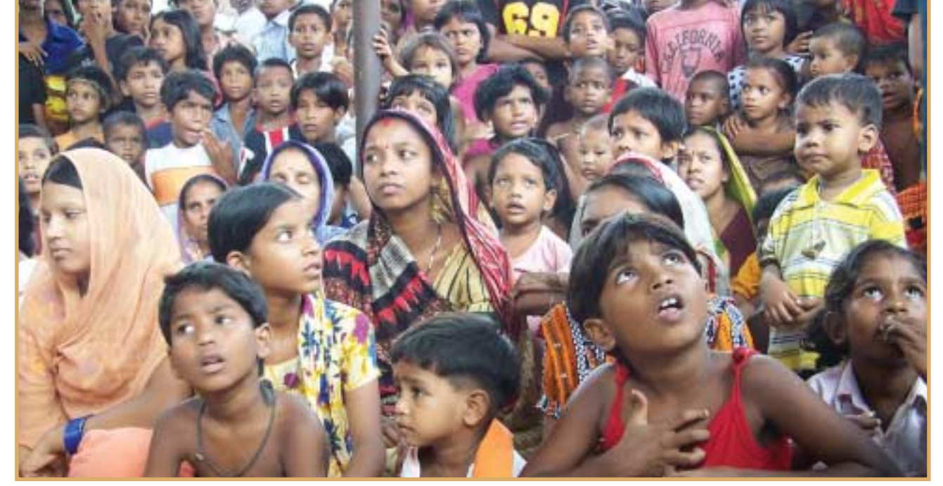
Dalit Children from Bangladesh

and also provided support to the National Council of Dalit Christians which spearheaded this campaign.