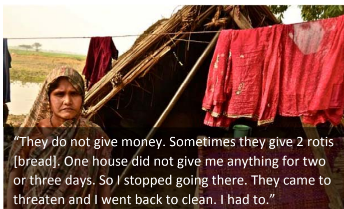
"They do not give money. Sometimes they give 2 rotis [bread]. One house did not give me anything for two or three days. So I stopped going there. They came to threaten and I went back to clean. I had to."

CEDAW, the Special Rapporteur on Violence against Women and the Special Rapporteur on Slavery have all expressed concern over Dalit women engaging in manual scavenging.