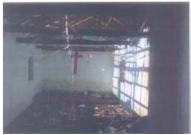
More than one hundred churches, presbyteries and convents were destroyed

There is no evidence that the Christian churches in the area use either forceful or coercive measures to convert people. On the other hand The VHP have a stated aim to convert and in 2002 proudly claimed to have converted 5000 people 'back' to Hinduism.<sup>3</sup> Furthermore there are numerous accounts of violently forced conversions having taken place in 2008.