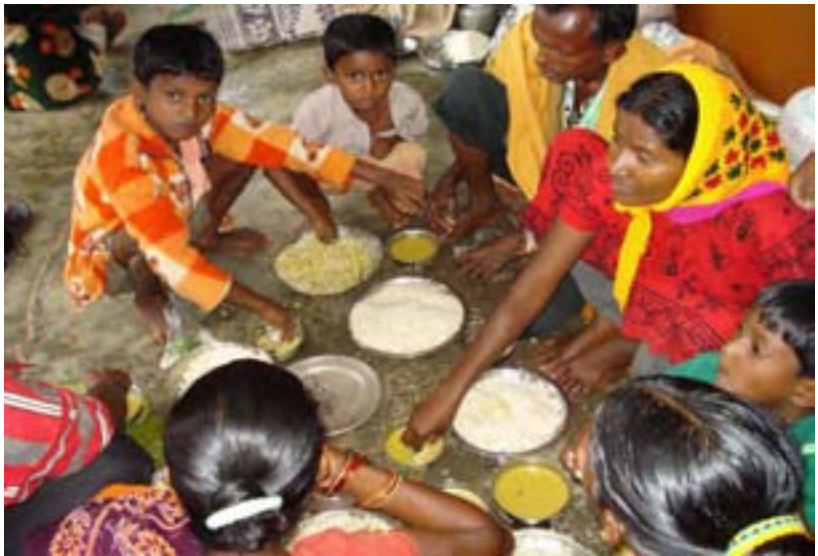
Relief camp residents have lived for months on a diet of only dal and rice

Camp residents have been given just one set of clothes each i.e. one sari, one petticoat and a blouse for women, one dhoti and a shirt for men, one pant and one shirt for boys and a frock for girls. Each family has been provided with three blankets, two buckets, one tent in which six to eight families are accommodated.