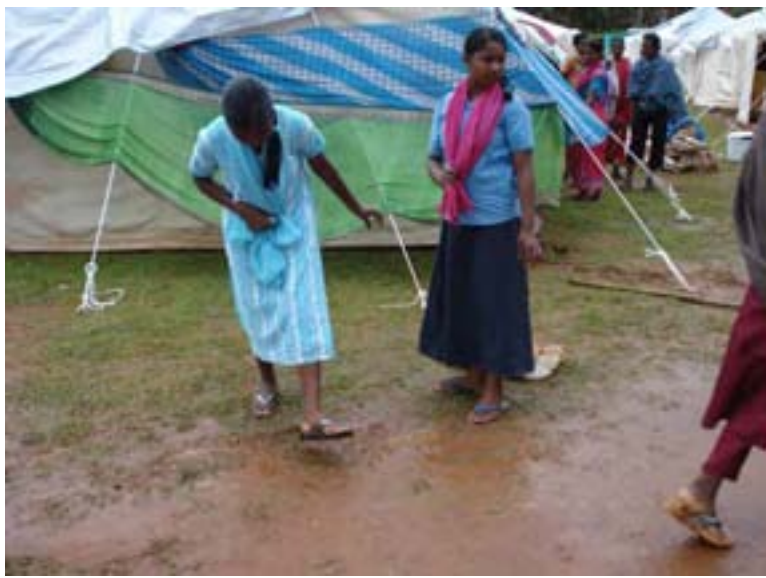
Weather conditions add to the misery of life in the camps

One resident of K. Nuagoan camp had sustained an injury to his left hand as a result of a bomb blast in the camp. He was accompanied to hospital by the BDO (Block Development Officer) but when charged Rs.12000 for treatment the BDO only paid Rs300 and the remaining Rs900 had to be met by the resident which he was able to pay only by borrowing.