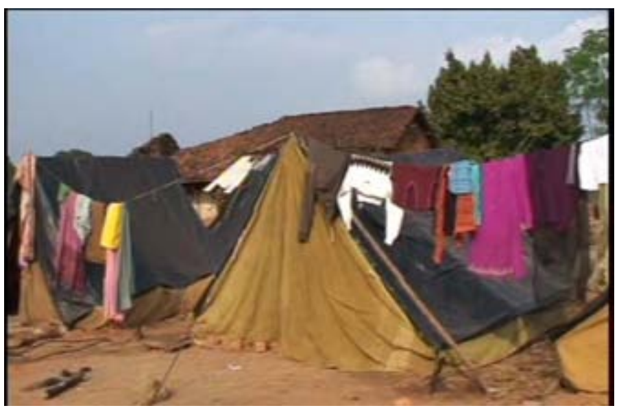
Dismal conditions in the relief camps