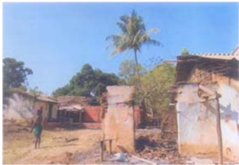
A home in ruins after the December rioting

Such an approach continues till this date. The assailants remain at large moving around with impunity knowing that they have the full support of the Police and the State while victims are further persecuted by the very institutions that exist to protect them.