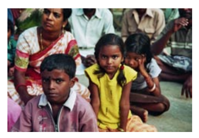
Figure 9: Dalit children from the village of Nonankuppam, Pondicherry, January 2005. Their families — who do backwater fishing for a living — were denied the government relief package provided to the Meenavars living in same village who are doing exactly the same work in the same place.

THE ADMINISTRATION JUMPED INTO THE RELIEF WITH A GOOD HEART, BUT THE CASTE MINDSET IS VERY STRONG: THE BUREAUCRATS DID NOT EVEN CONSIDER THAT NON-FISHERMEN MAY HAVE SUFFERED TOO. GOVERNMENT BUREAUCRATS WILL ALWAYS CLAIM THEY DO NOT DISCRIMINATE AND DID NOT DISCRIMINATE IN THE TSUNAMI RELIEF. THERE ARE TWO KINDS OF DISCRIMINATION WITHIN THE PUBLIC SERVICE: THAT OF THE ANTAGONISTIC BUREAUCRATS WHO PRACTICE NAKED DISCRIMINATION AND BIAS; AND THAT OF THE APATHETIC BUREAUCRATS WHO FAIL TO USE ANY INITIATIVE TO RESOLVE DISCRIMINATION. MOST BUREAUCRATS ARE SOAKED IN THE NEUTRAL POSTURE.