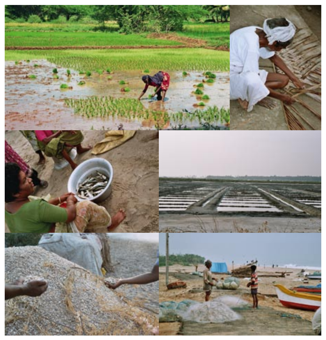
Figure 1: Different forms of Dalit labour in the Tamil Nadu coastal region: rice paddy labour, thatch-making, salt-pan harvesting, net-mending, shell collection and fishvending (clockwise from top left)

of their relation of dependency on the fishing community. They claimed 'caste blindness', which is a euphemism for saying they chose not to take the effort required to help Dalits.