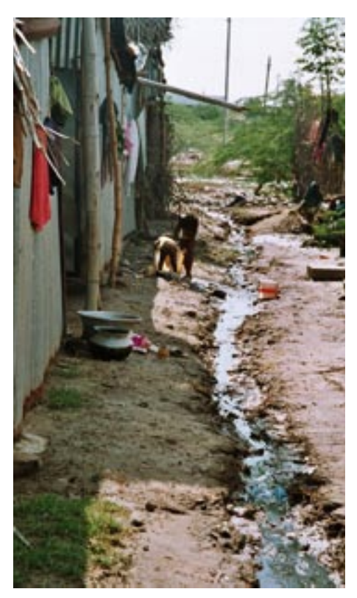
Figure 7: Sewerage runs past the Dalit section of Pandagasalai temporary shelter, Nagapattinam, September 2005

OUR CAMP STILL DOES NOT HAVE LIGHTING OR FANS, AS OTHER CAMPS DO. OTHER CAMPS HAVE ALREADY BEEN PROM-ISED CERTAIN SITES FOR PERMANENT SHELTERS, BUT WE HAVE NOT BEEN CONSULTED AT ALL. RELIEF IS SPEEDILY DELIV-ERED TO OTHER CAMPS, BUT NOT HERE. WE ARE ALWAYS THE LAST TO RECEIVE ANYTHING, IF WE RECEIVE IT AT ALL.