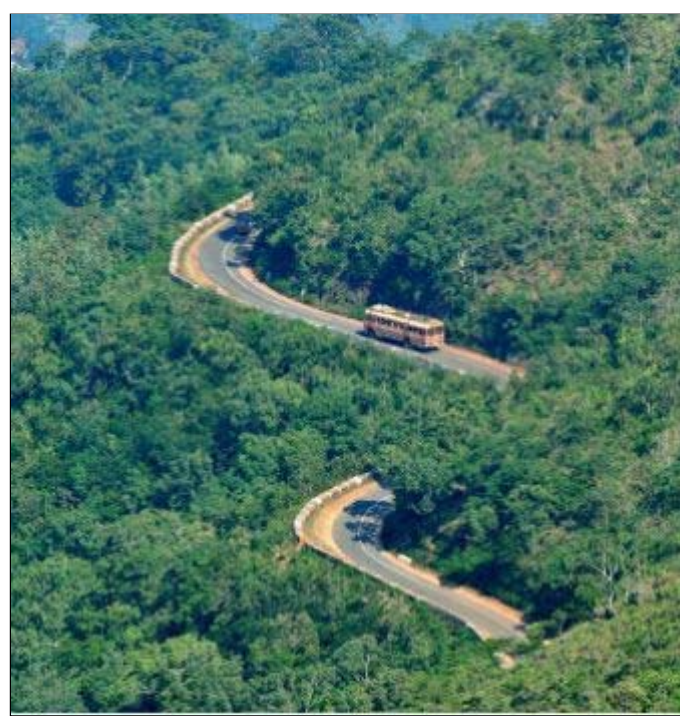
The lush green hills near Galikonda in Visakhapatnam may soon become a thing of the past with bauxite mining threatening to destroy the forest cover. Tribal families living in the hills stand to lose their income from forest produce.

The poor implementation of the Act is also a result of the district machinery cracking down on all forms of ordinary and legitimate democratic protests. For instance, in Madhya Pradesh, many social activists were slapped with cases under the Madhya Pradesh Rajya Surakshya Adhiniyam, 1990. This is important, political analysts believe, for the age-old industrial-caste-administration-military nexus to maintain its supremacy over the rich resources of the region.