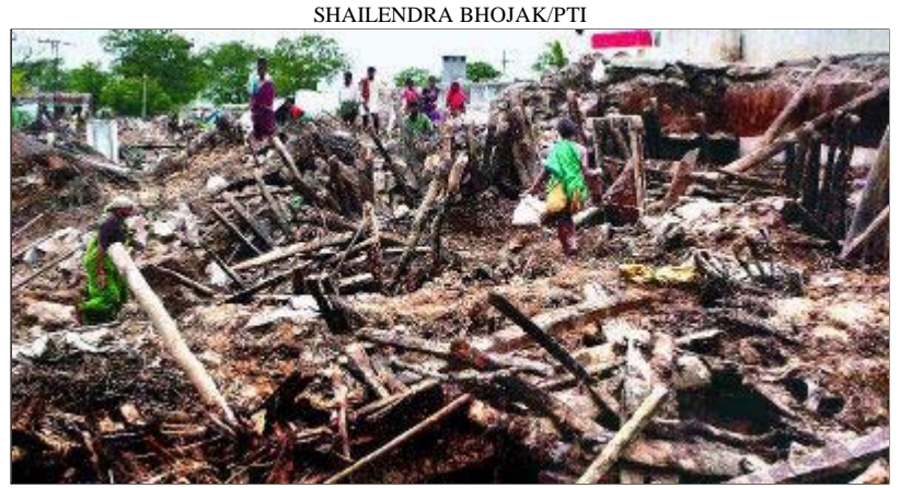
AT TALMARI VILLAGE in Raichur district in Karnataka on October 6, when the flood waters had receded.

The floods have inundated almost 4,500 villages and destroyed over 500,000 dwellings in Karnataka.