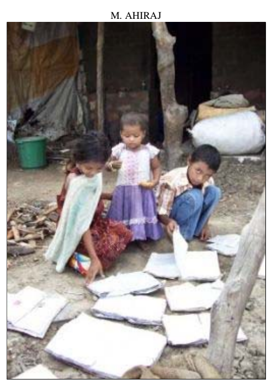
CHILDREN DRY THEIR books after the floods at Sridhargadda village in Bellary district.

The road from Bellary city to Siruguppa taluk in the same district was lined with plastic tents. The families were staying with whatever little they managed to salvage.