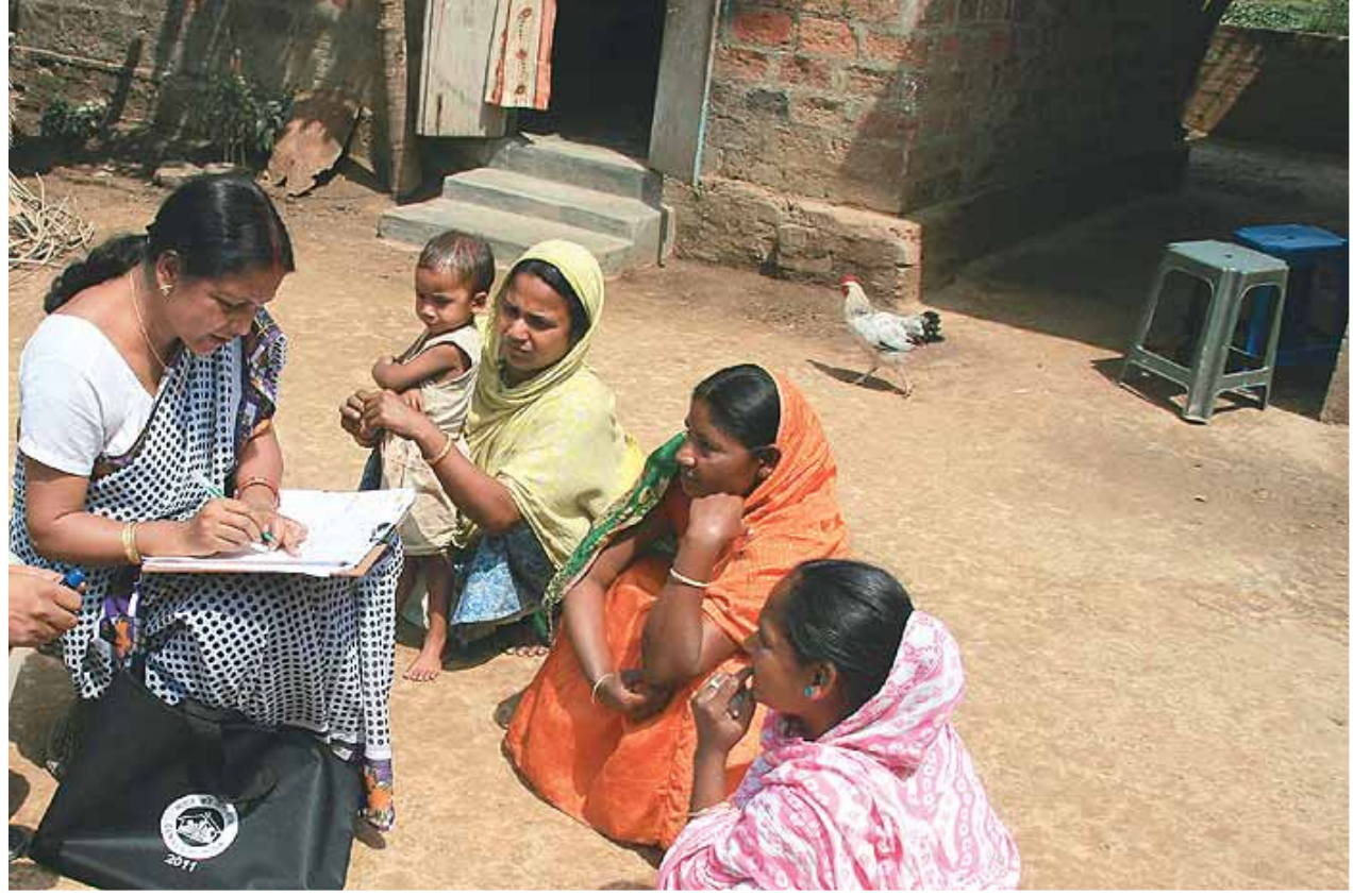
A census official with a family in a village in Assam