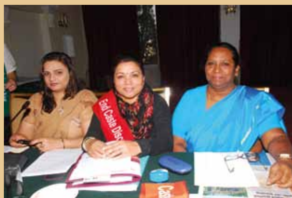
Dalit women leaders from Pakistan, Nepal, India and Bangladesh played a crucial part in discussions at the International Consultation.