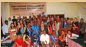
Participants, International Consultation on Caste-Based Discrimination 29 November – 1 December 2011 Kathmandu, Nepal.